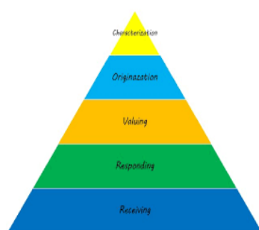
Figure 2 Levels of the Affective Domain

The affective domain in learning is related to students' attitudes and values, which include students' behavioral time, such as feelings, interests, attitudes, emotions, and values. (Djazari & Sagoro, 2011b) The quantum teaching method can be applied in teaching activities to improve student learning outcomes in the affective domain, which appears in various actions such as focus, discipline, and motivation in learning. According to Krathwohl (1961), five levels can improve the affective domain: receiving or attending , responding , valuing , organization , and characterization .