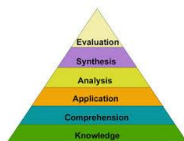
Figure 1 Levels of the Cognitive Domain

The Quantum Teaching method can improve intelligence in the cognitive domain. According to Bloom, the cognitive domain involves all brain activities, such as memorizing, understanding, applying, analyzing, synthesizing, and evaluating. According to Agarwal et al., achievement of cognitive aspects can be achieved through six levels ranging from the lowest to the highest level, namely knowledge, comprehension, application, analysis, synthesis, and evaluation , as in the following picture (Agarwal and Solanki, 2022)